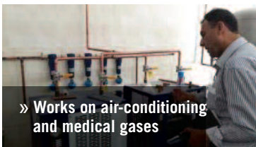
» Works on air-conditioning and medical gases