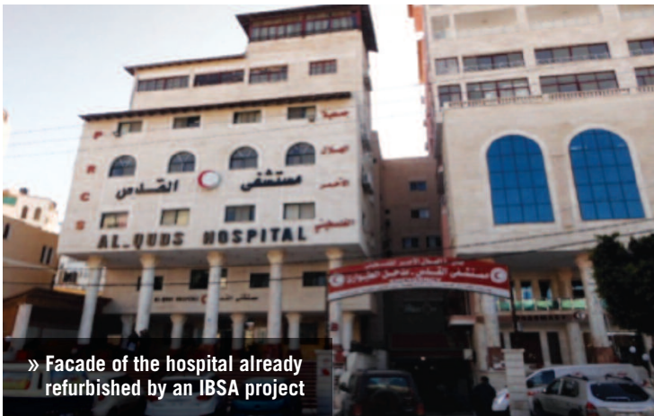
» Facade of the hospital already refurbished by an IBSA project

These projects were designed in line with the Palestinian National Health Strategy, which has the objective of assuring the rights of all citizens to quality, sustainable primary, secondary and tertiary health services. In line with this strategy, these two interrelated initiatives seek to strengthen partnerships so as to ensure access for all Palestinians to health services.